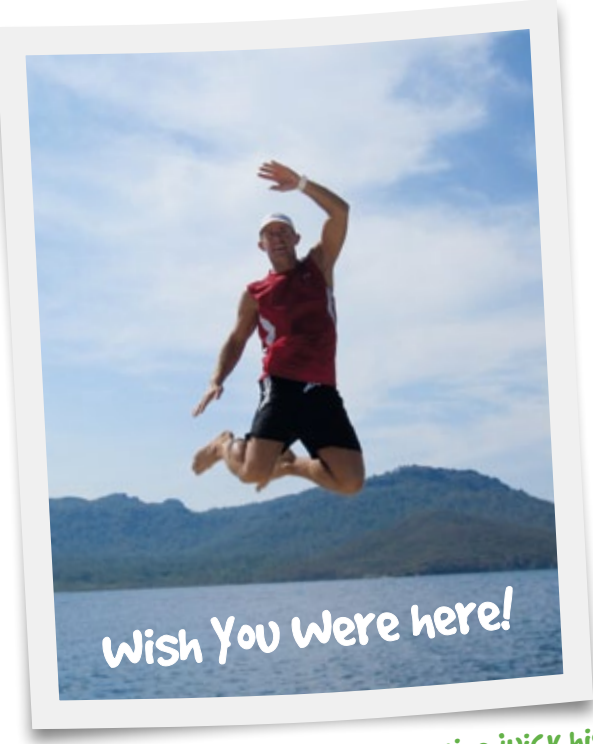
No camera tricks - just on a genuine juicy high!